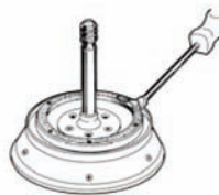
Optional 7" stair cleaning head Felt Vacuum Seal